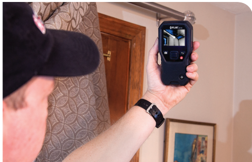
Scanning ceiling & wall joint for moisture issues